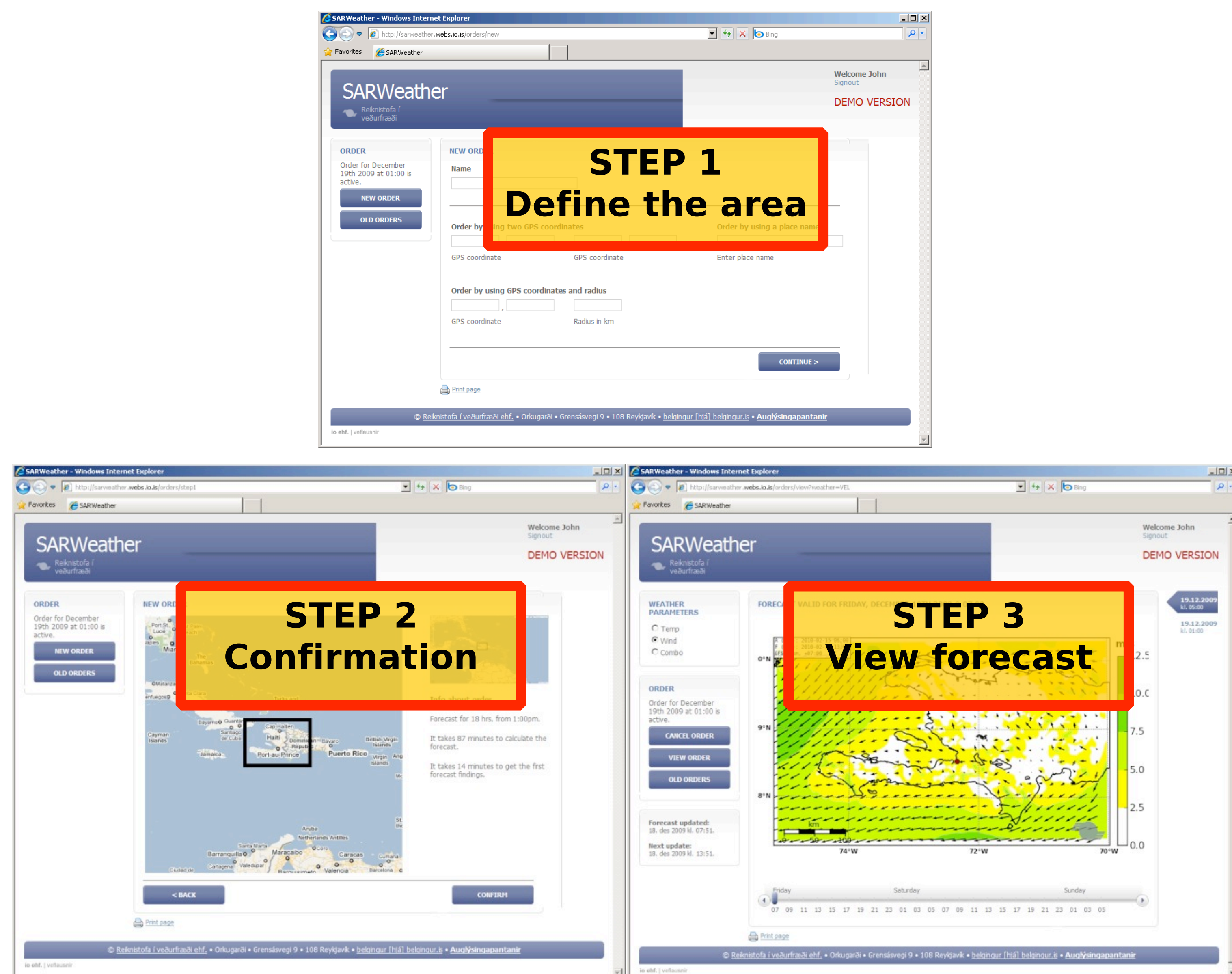
Figure 3: SARWeather is On-Demand, has global coverage, and is deployable in three easy steps.

Simple three step process: Initiating a highly accurate weather forecast is simple when using SARWeather.