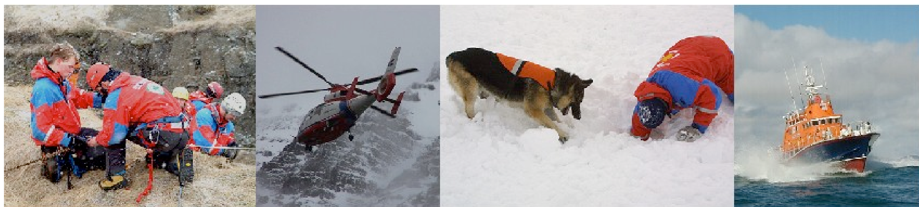
Figure 1: Weather often greatly affects SAR missions.

Introduction: It is rather the rule than the exception that rescue missions and search operations for missing people are initiated in extreme weather conditions. In any case, such missions are very dependent on the weather forecasts as the safety of the field personnel must be secured in the best possible manner. SAR operators and personnel work in extreme conditions, where better and more timely information is of paramount importance.