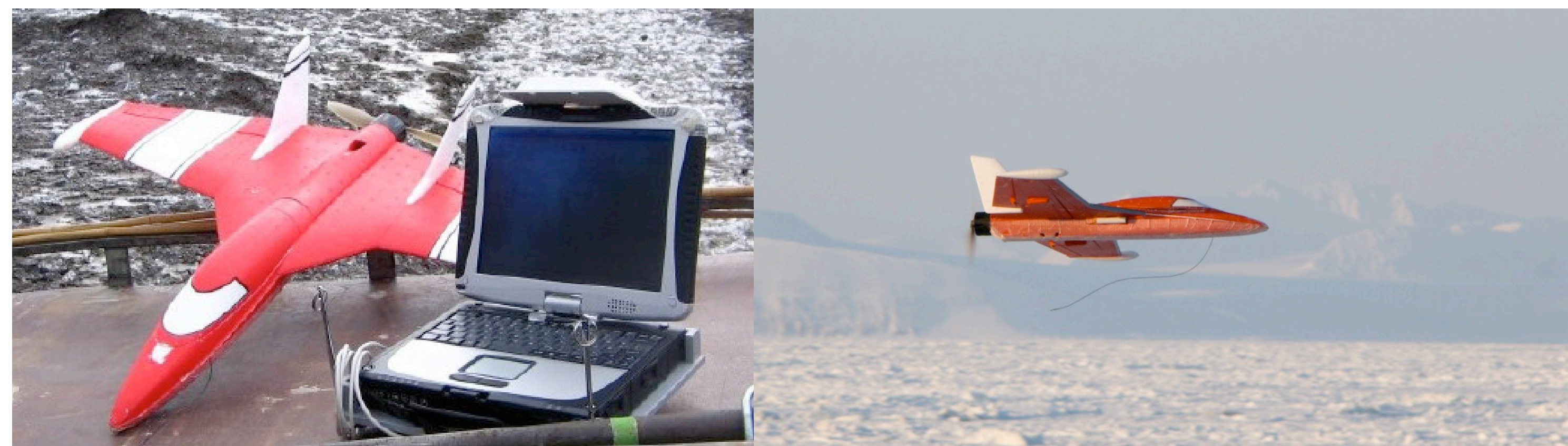
Figure 2: A simple UAV (SUMO - Small Unmanned Meteorological Observatory) can operate as a re-usable radiosonde, gathering information on temperature, pressure, humidity and winds up to 4km above ground.

On-site measurements and data assimilation: New methods for data assimilation and nowcasting are under constant development and aim at providing increasingly accurate weather forecasts on the time scale of minutes and spatial scales of few hundred meters. Obtaining the extra meteorological observations needed as input to these methods can however be tricky in remote areas or regions severely affected by natural catastrophes. The range of UAV's flying meteorological observatories is a vital addition to the toolbox. Increasingly robust aircraft models can be deployed at a well-defined extra cost, with current weather conditions, in particular wind speed, being the determining factor. Meteorological observatories may even be retrofitted on SAR reconnaissance drones.